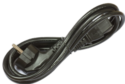
2 IEC cords